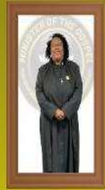
Minister Annie L. White